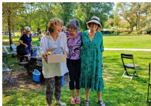
Our coffee morning, 21 st July and the treasure hunt winning team,