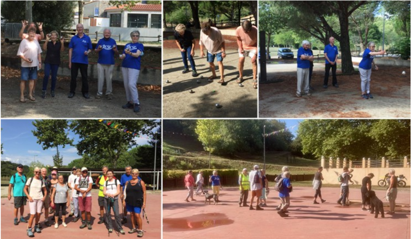
Boules and walkers, complete with doggies