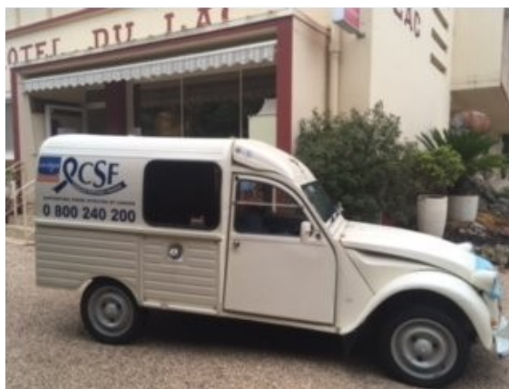
Pictured right is our 'support van'.