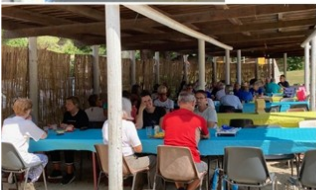
Activity for Life Lunch