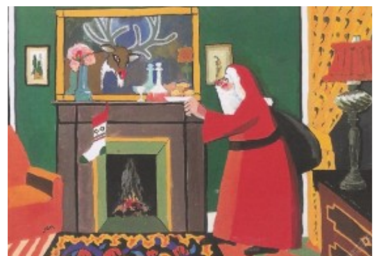
SANTA

Seasons Greetings to all our members and readers for Christmas 2021