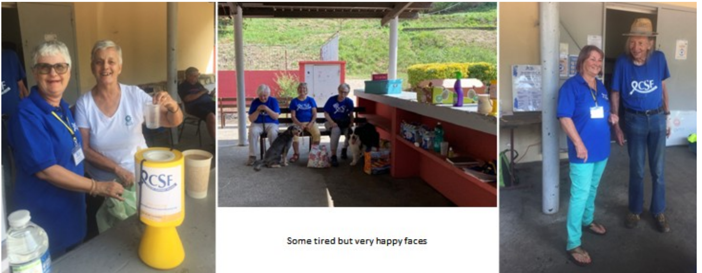
Some tired but very happy faces